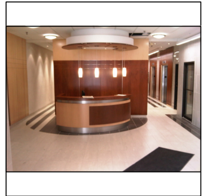
INTERIOR LOBBY VIEW